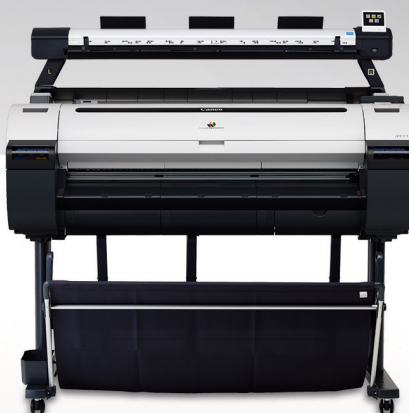
iPF770 MFP L36ei