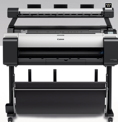
TM-300 MFP L36ei

Free Layout Plus: New! Nest, tile, and create custom layouts before printing your files with this print utility. Use the Plug-in feature to print directly from Microsoft office programs. Compatible with the TM-300 and TM-200 models only.