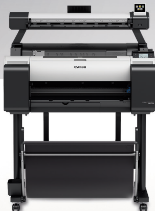
TM-200 MFP L24ei