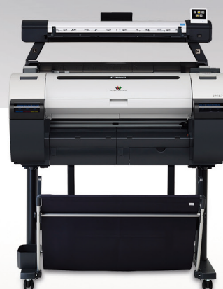
iPF670 MFP L24ei